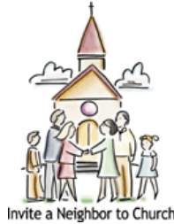
Invite a Neighbor to Church