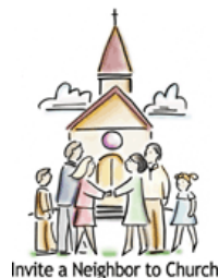
Invite a Neighbor to Church

132 Cherokee Road, Thomaston, GA 30286 (706) 647-3335 Fax: (706) 648-2658 Website: www.thomastonfirstumc.org Email: thomastonfirstumc@gmail.com